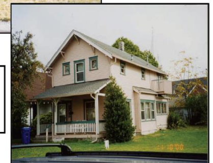
After CPTED Improvements