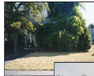
Before CPTED Improvements

You can use natural surveillance by keeping your bushes trimmed lower than 36 inches and your trees trimmed higher than 7 feet.